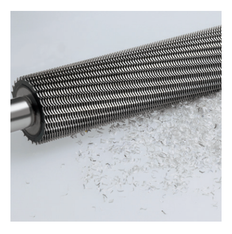
SOLID STEEL CUTTING SHAFTS

Robust and durable: high-quality paper clip proof cutting shafts with lifetime guarantee under conditions of fair wear and tear (except fine cut models MC and SMC).