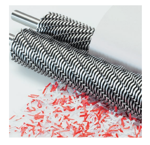
SOLID STEEL CUTTING SHAFTS

Robust and durable: high-quality paper clip proof cutting shafts with lifetime guarantee under conditions of fair wear and tear.