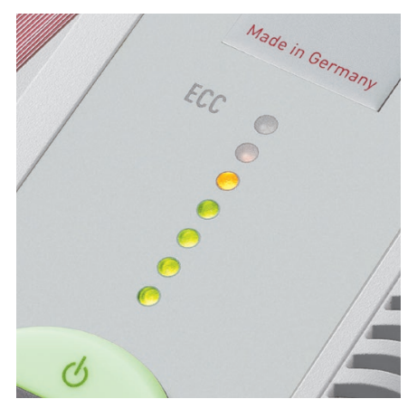
ECC - ELECTRONIC CAPACITY CONTROL This electronic feature indicates the used sheet capacity during shredding process to avoid paper jams.

Ease of operation: intelligent multifunction switch element with integrated optical signals indicating the operational status. Additional "emergency switch" function.