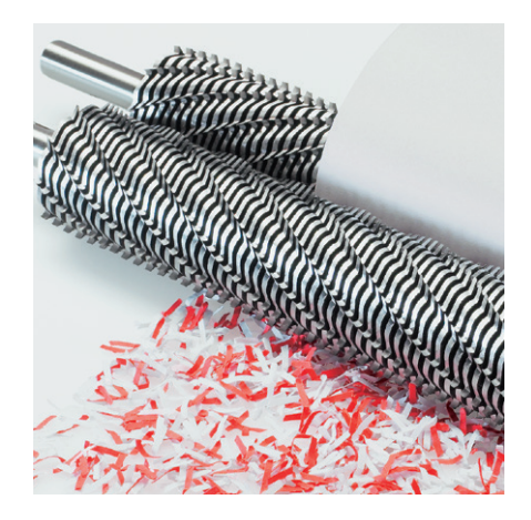
SOLID STEEL CUTTING SHAFTS

Robust and durable: high-quality paper clip proof cutting shafts with lifetime guarantee under conditions of fair wear and tear (except fine cut model SMC).